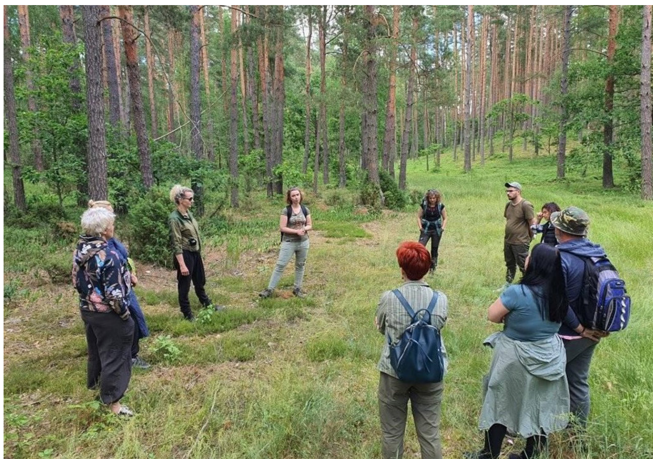
Fig. 1. Participants of the ecotherapeutic program in Biebrza River Valley (Poland) during their field workshop – forest therapy

Therapeutic ornithology includes activities aimed at improving mental wellbeing through various forms of contact with wild bird species: field trips (Cammack et al., 2011), observations in the garden (Murawiec and Tryjanowski, 2020), feeding (Cox and Gaston, 2016; Ratcliffe et al., 2013), listening (White et al., 2018), photographing and other activities (Cox and Gaston, 2015; Tryjanowski et al., 2022). In contrast to bird walks, therapeutic ornithology does not