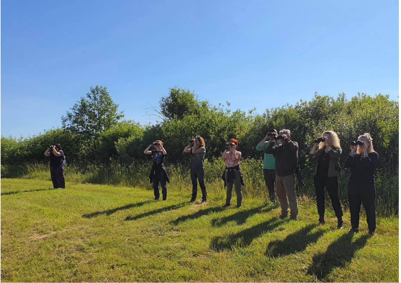
Fig. 2. Participants of the ecotherapeutic program in Biebrza River Valley (Poland) during their field workshop – therapeutic ornithology

focus on the mere recognition of bird species, but is based on mindfulness (Tryjanowski and Murawiec, 2020). Therefore, sensory perceptions, emotions, and cognitive activities accompanying observations (such as classifying, comparing) are essential. The term “bird therapy” appeared in the title of Joe Harkness’s book (2020). The above approach is consistent with the one presented in the cited book. In Poland, the original monograph entitled Therapeutic Ornithology was published in 2020 (Tryjanowski and Murawiec, 2020) and became the basis for the development of this therapeutic method.